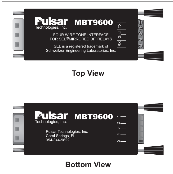
Figure 1. MBT9600 Four-Wire Modem.